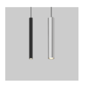
TULA MOVE IT