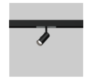
JUST 32 FOCUS MOVE IT 25