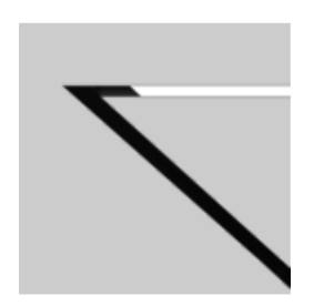
MOVE IT 25 trimless system